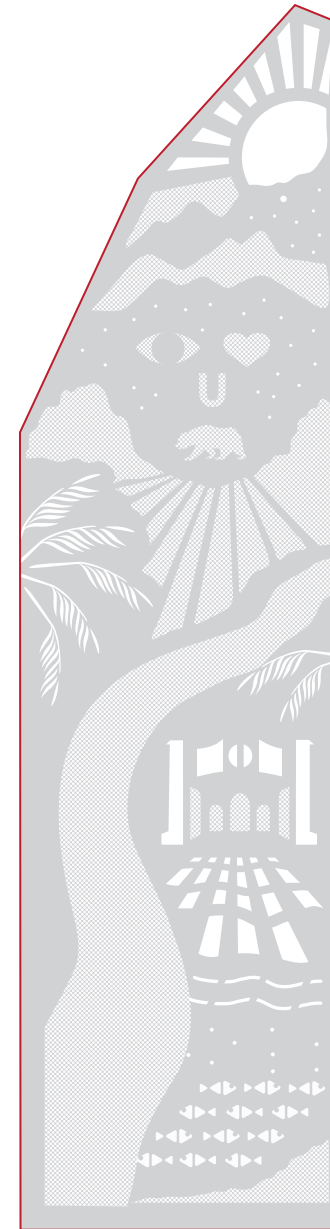
April Banks - Qty. 32